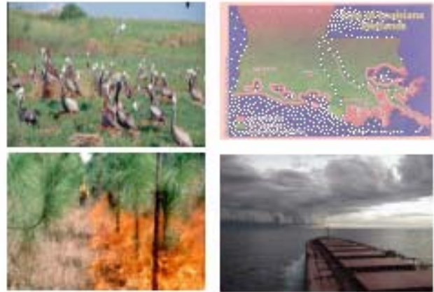
Distributed framework for successful dynamic Gulf Coast

to efficiently handle Internet and telephone management under emergency conditions. To resolve this issue, an ad hoc mode for cellular networks is urgently needed. The availability to communicate is very critical for first responders, who conduct operations to save lives, restore the infrastructure and return the population to normal living conditions. The experience has shown that among the telecommunications infrastructures, the Internet can serve as the prime way for personal communication, news, and recovery information. By dynamically restructuring the data grid in response to network failures and by dynamically migrating some of the data processing applications to idle compute resources close to the sensors