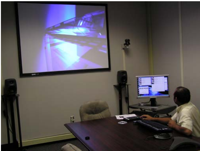
Access Grid facility at the CS department

The CS department has recently acquired the Access Grid facility. It is an ensemble of resources consisting of multimedia large-format displays, presentation and interaction environments, and interfaces to Grid middleware and to visualization environments. These resources are used to support group-to-group interactions such as distributed meetings, lectures, seminars, etc. across the Grid. The AG is now used at several hundreds of institutions worldwide. Our AG node consists of a large projection wall, one projector, one computer system, cameras, and a seating area for about 10 people. It is located in 140 Coates.